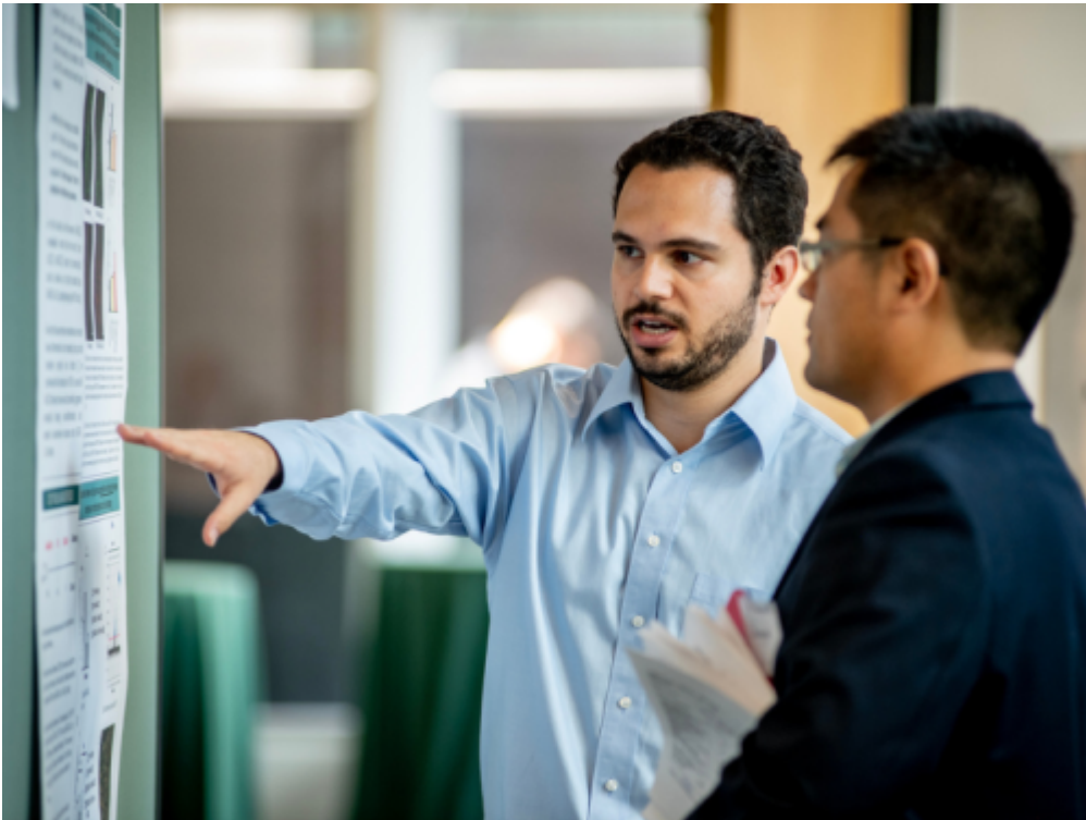
A poster presentation highlighted student research.